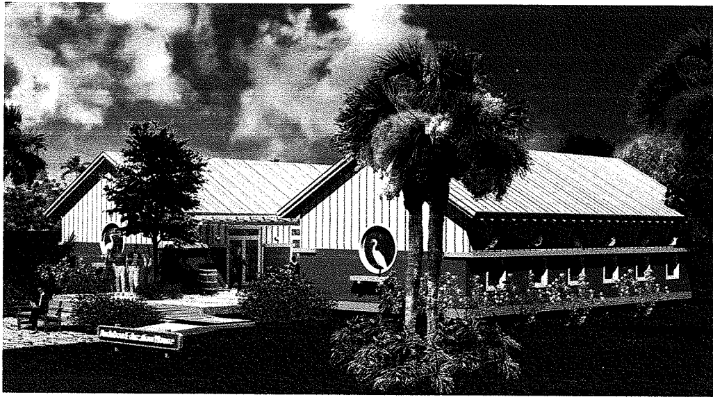
Audubon House "Gateway to Nature" Pelican Island Audubon Society