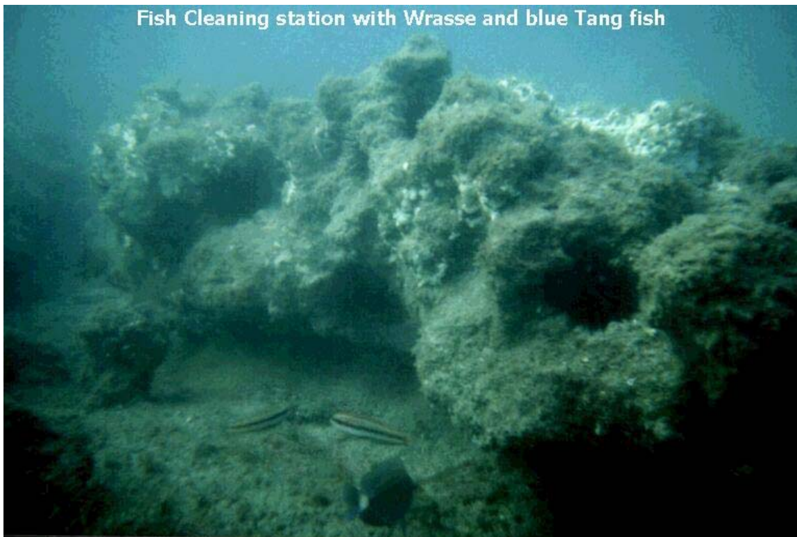
FIGURE 4 - Nearshore limestone reef, Indian River County