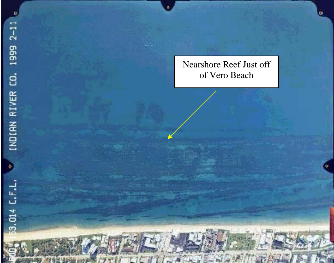
FIGURE 3 - Aerial of the Nearshore Reef