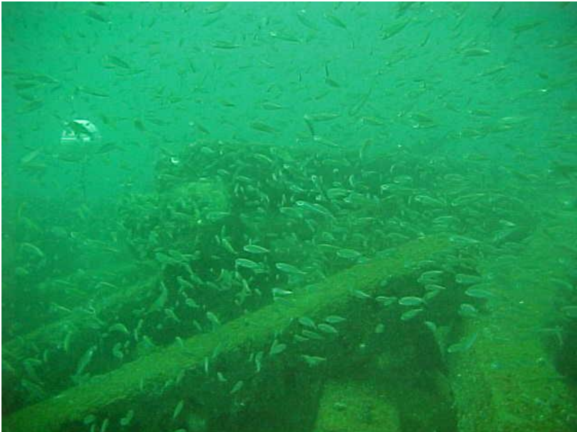
Baitfish on the reef