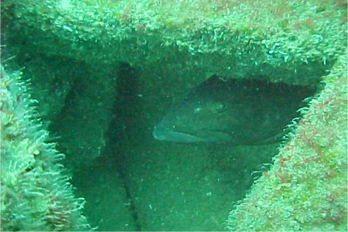
Gag grouper on the reef