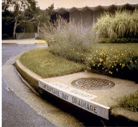
Storm drains can be labeled with stencils to discourage dumping