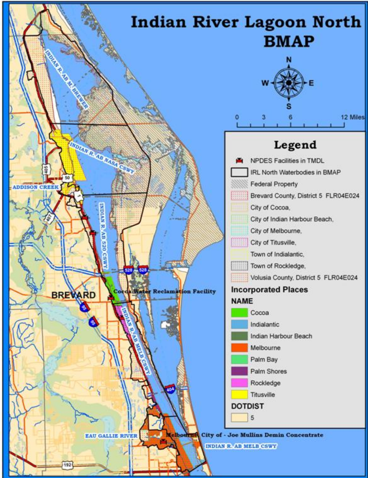
FIGURE 1: IRL NORTH BMAP AREA