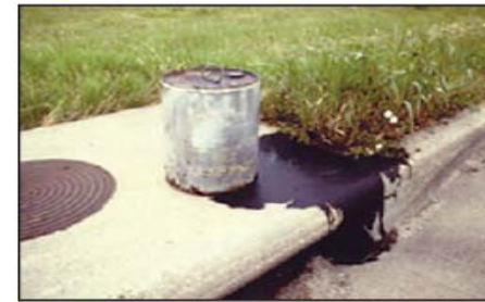
Figure 5: Dumping at a storm drain inlet

Examples of prohibited practices include the connection/disposal of wastewater, grey water (laundry), rooftop runoff conveyances, chemicals, and other waste products into ditches, storm sewers, catch basins, and any waterbody.