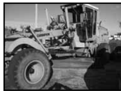
1994 Champion Grader