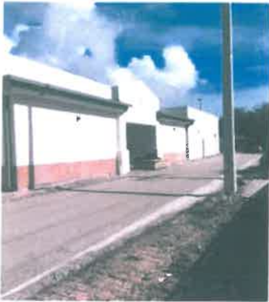
Beachland Elementary School Cafeteria & Classroom Building