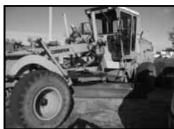
1994 Champion Grader